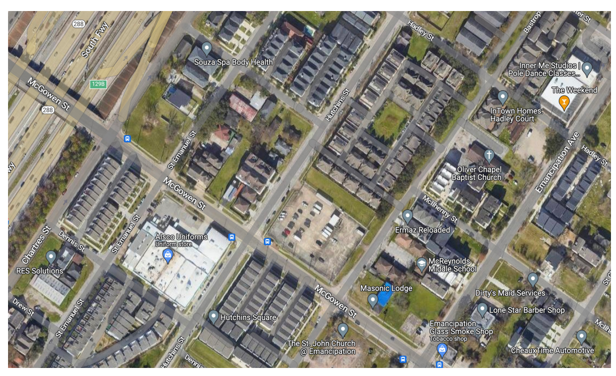
Figure 1. Small-Lot Subdivisions Outside the I-610 Loop Built Before and After 2013

Figure 1 shows a subdivision west of Hutchins Street that is built to the performance standards. This configuration is commonly referred to as "shared driveway" townhouses. The performance standards encourage this development pattern because the driveway contributes to the 60 percent