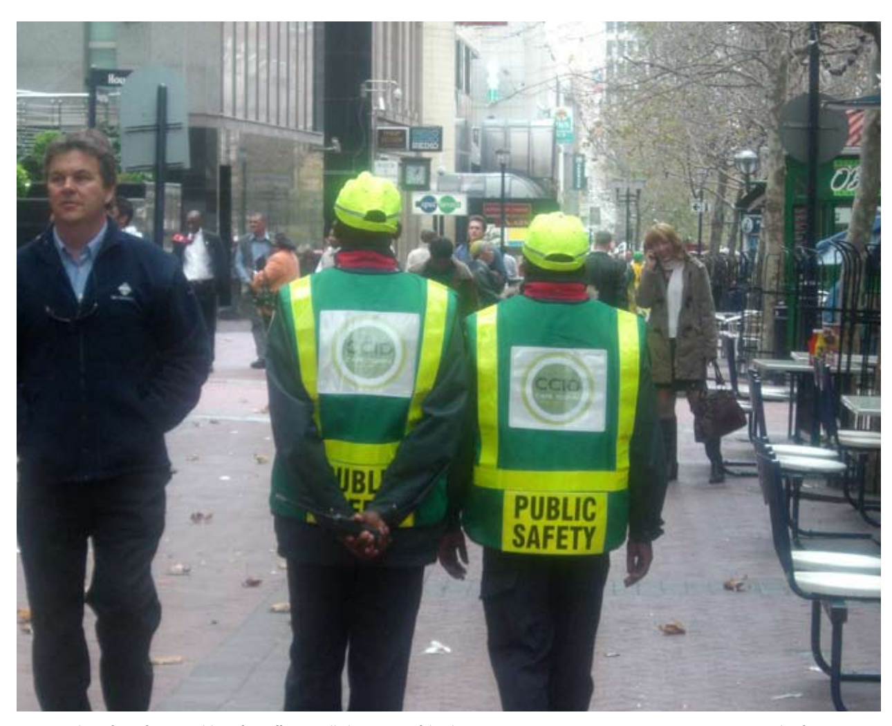
Assuring the safety of BIDs: Public safety officers walk the streets of the the Center City Improvement District, Cape Town, South Africa.