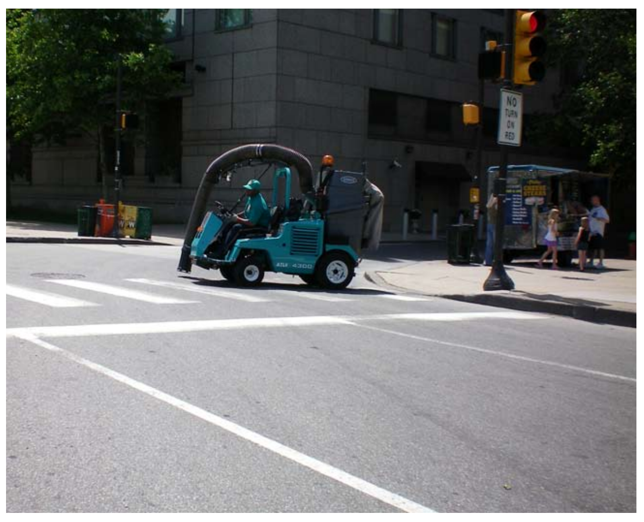
No longer "Filthydelphia": the Center City District's sidewalk sweepers clean up the area around Logan Circle, Philadelphia, PA.