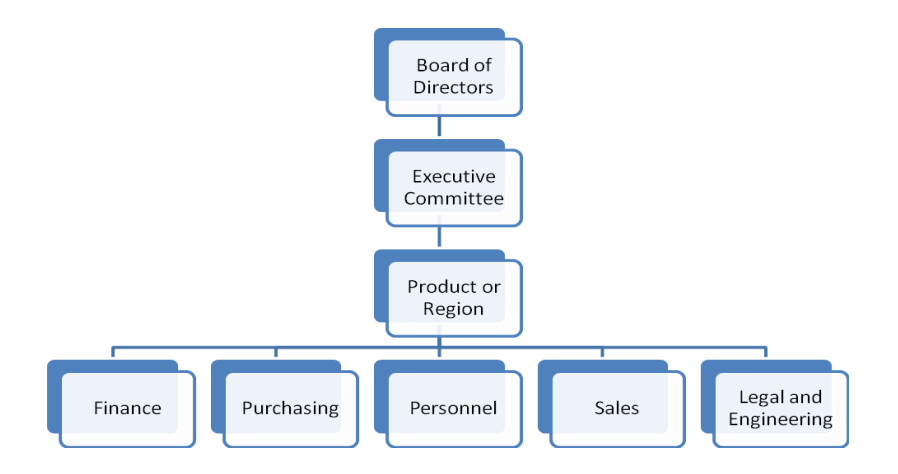
Figure 2: The Multidivisional Form (Chandler, 1969).

Figure 1: The Growing Departmental Form (Chandler, 1969).