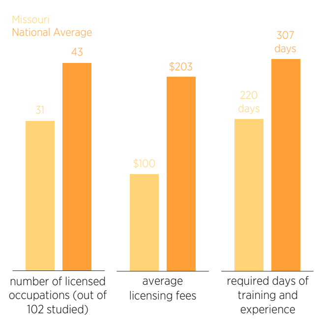
Figure 1. Number of Licensed Occupations, Fees, Required Training and Experience

primarily used to protect public safety.