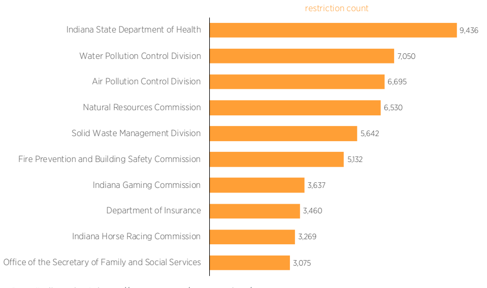
Figure 2. Top 10 Regulators in Indiana in 2018