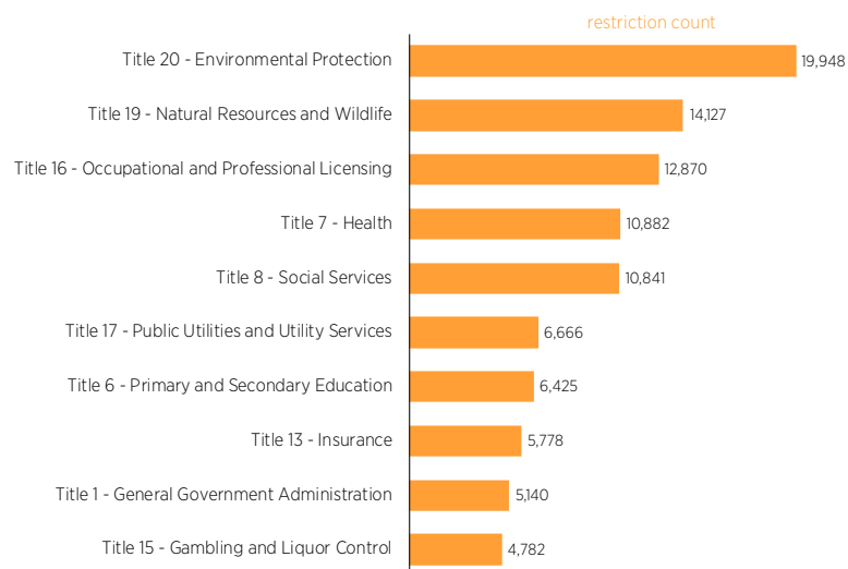
Figure 2. Top 10 Titles in the New Mexico Administrative Code in 2018