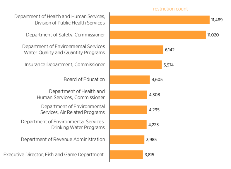
Figure 2. Top 10 Regulators in New Hampshire in 2019