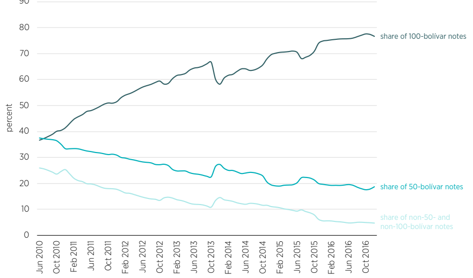
Figure 2. Share of 100-Bolívar Notes in Circulation and the Combined Share of All Other Denominations (2-, 5-, 10-, 20-, 50-Bolívar Notes) in Circulation, June 2010-December 2016 80 share of 100-bolívar notes