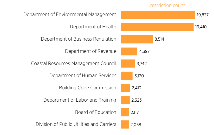
Figure 2. Top 10 Regulators in Rhode Island in 2019

State RegData also reveals that the 2019 RICR contains 92,522 restrictions and 5.7 million words. It would take an individual 316 hours—or almost 8 weeks—to read the entire RICR. That's assuming the reader spends 40 hours per week reading and reads at a rate of 300 words per minute. By comparison, there are 1.09 million additional restrictions in the federal code.<sup>5</sup> Individuals and businesses in Rhode Island must navigate these different layers of restrictions to remain in compliance.