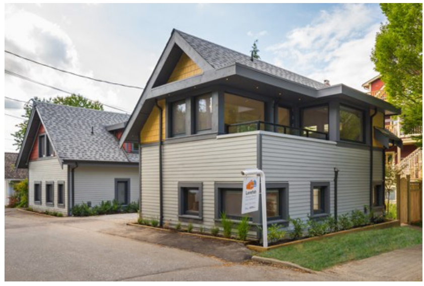
Figure 4. Laneway Homes in Vancouver