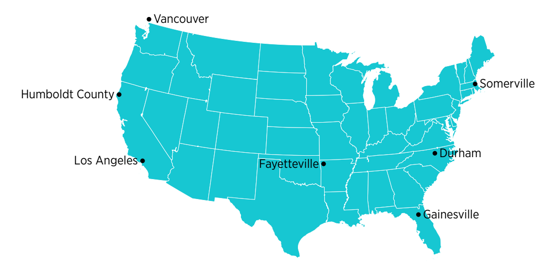
Figure 1. Seven Communities with Accessory Dwelling Unit Ordinances Worth Imitating

There are many other attributes of ADU codes, including permit costs, uncertainty, and building codes that can effectively thwart new ADUs. For example, Austin, Texas, requires a rental ADU to have its own water meter and often to upgrade the tap line—and the cost of that reportedly runs to $25,000 there.<sup>6</sup>