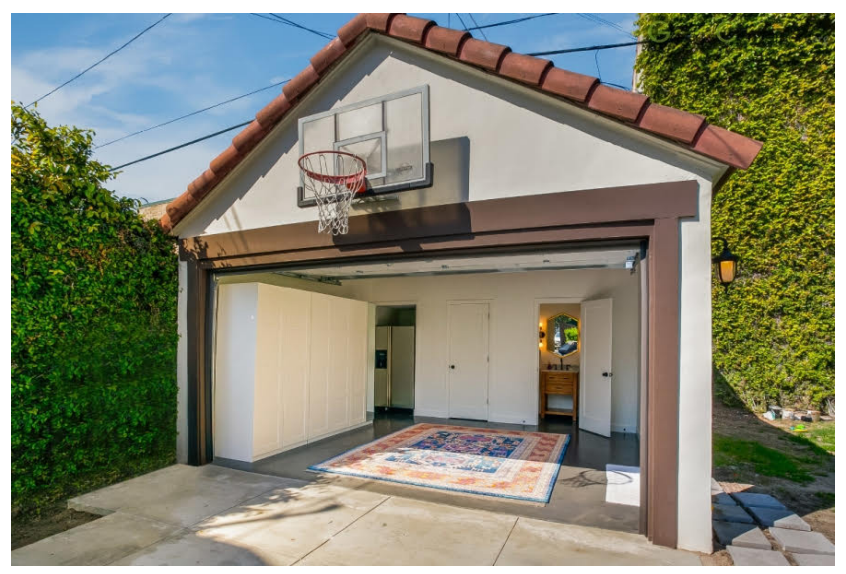
Figure 2. A Converted Garage in Los Angeles