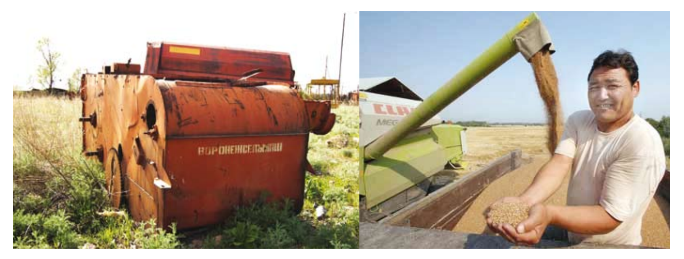
Decline and Rise of Agriculture: Left, bankrupt former kolkhoz in the Almaty region. Right: restructered large-scale agricultural enterprise in Northern Kazakhstan using western production technology.

Due to privatization and farm restructuring, the number of collective farms has fallen. The area farmed by them also shrank from 92 percent in 1995 to 66 percent in 2001 and to 51 percent of Kazakhstan's total farmland in 2006. Family farms, on the other hand, grew rapidly and now about 48.1 percent of cultivated land belongs to individual farms. Household plots use about 0.7 percent of all agricultural lands.<sup>203</sup> In 2006, large-scale agricultural enterprises accounted for only 25 percent of all agricultural production, while household plots for 54 percent and peasant farms for 21 percent. However, corporate and peasant farms produce most crops (83 percent and 84 percent of total output, respectively), while household plots are predominantely engaged in animal production (78 percent of total output).<sup>204</sup>