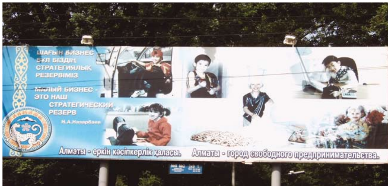
Advertisements like these with quotations from President Nazarbayev's speeches are a common sight. This one praises Almaty as the city of free entrepreneurship and small business as the strategic reserve of the country.

A single investment regime for domestic and foreign investors is a positive change, as it helps to provide equal conditions for all actors.<sup>103</sup> On the other hand, the vague formulation of the "grandfather's clause" and the amendments giving greater discretion to government officials are problematic, as they don't provide stable expectations.<sup>104</sup> In spite of these regulations, foreign investors in general still consider the investment climate in Kazakhstan positive. Neither the German Association of Entrepreneurs nor the German Embassy in Kazakhstan knows of cases of severe arbitrariness from government officials against foreign investors. In fact, international agencies and organizations consider Kazakhstan the CIS country with the most favorable environment for investment.