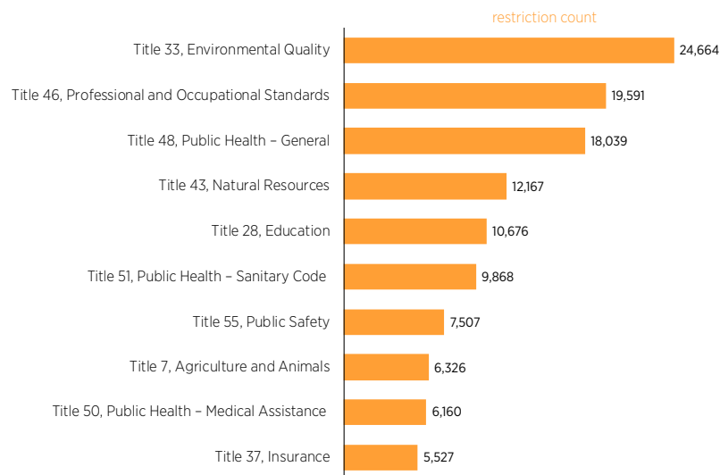
Figure 2. Top 10 Titles in the LAC in 2019