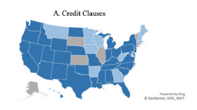
Figure 3. The Current State of Anti-Aid Provisions